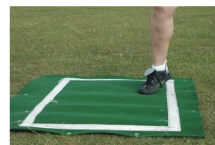
Photograph 5 & 6 - Lifts her foot off the side tape.

39.2.A penalty is given when a good ball is bowled, but the batter: