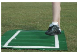
Photograph 4 – Stands on any part of the front or back tape.