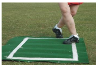
Photograph 3 – Swings her leg outside the 'home' round the back or front of the tape.