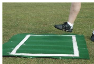
Photograph 5 & 6 – Lifts her foot off the side tape.